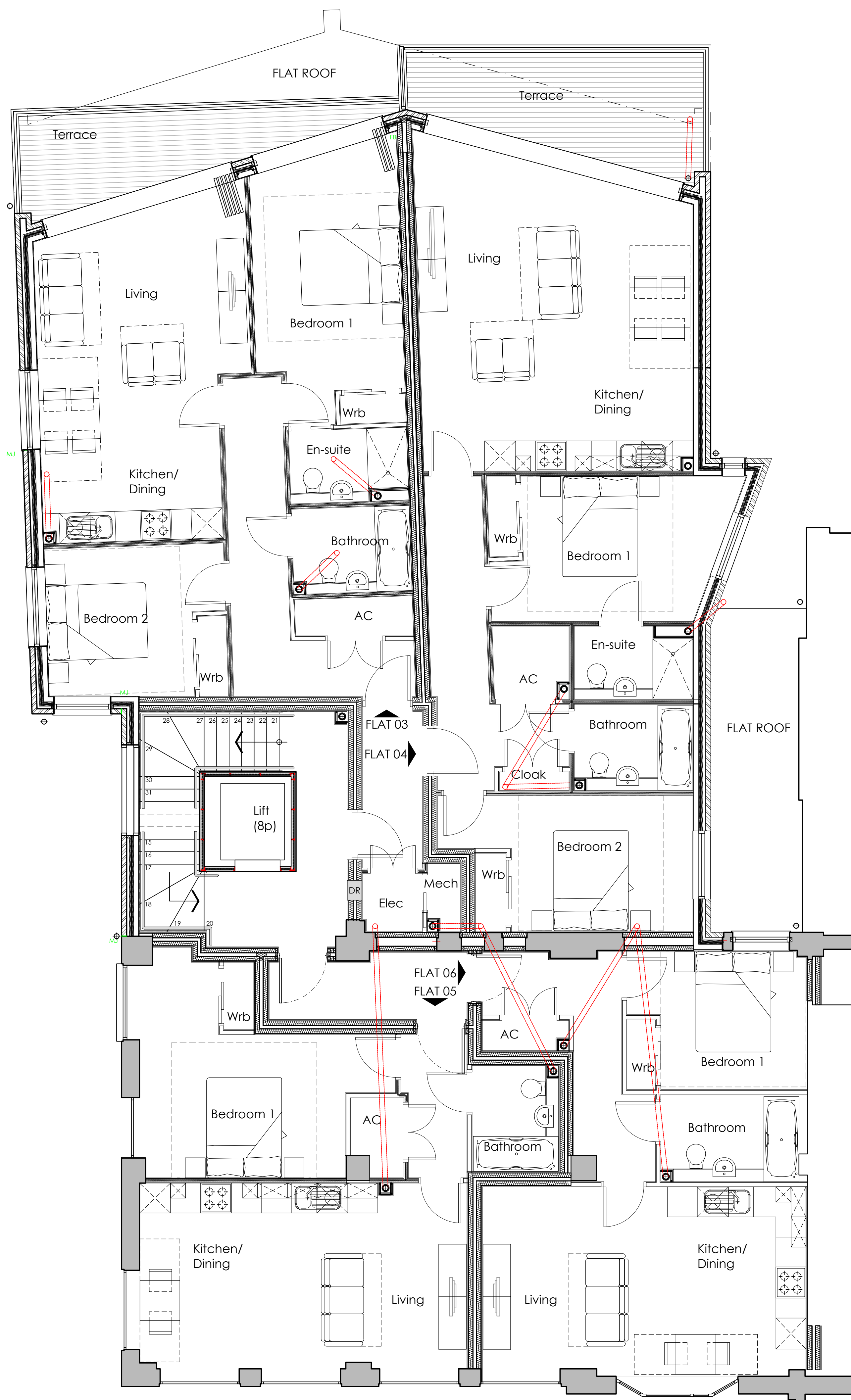
Proposed First Floor Plan @ 1:50