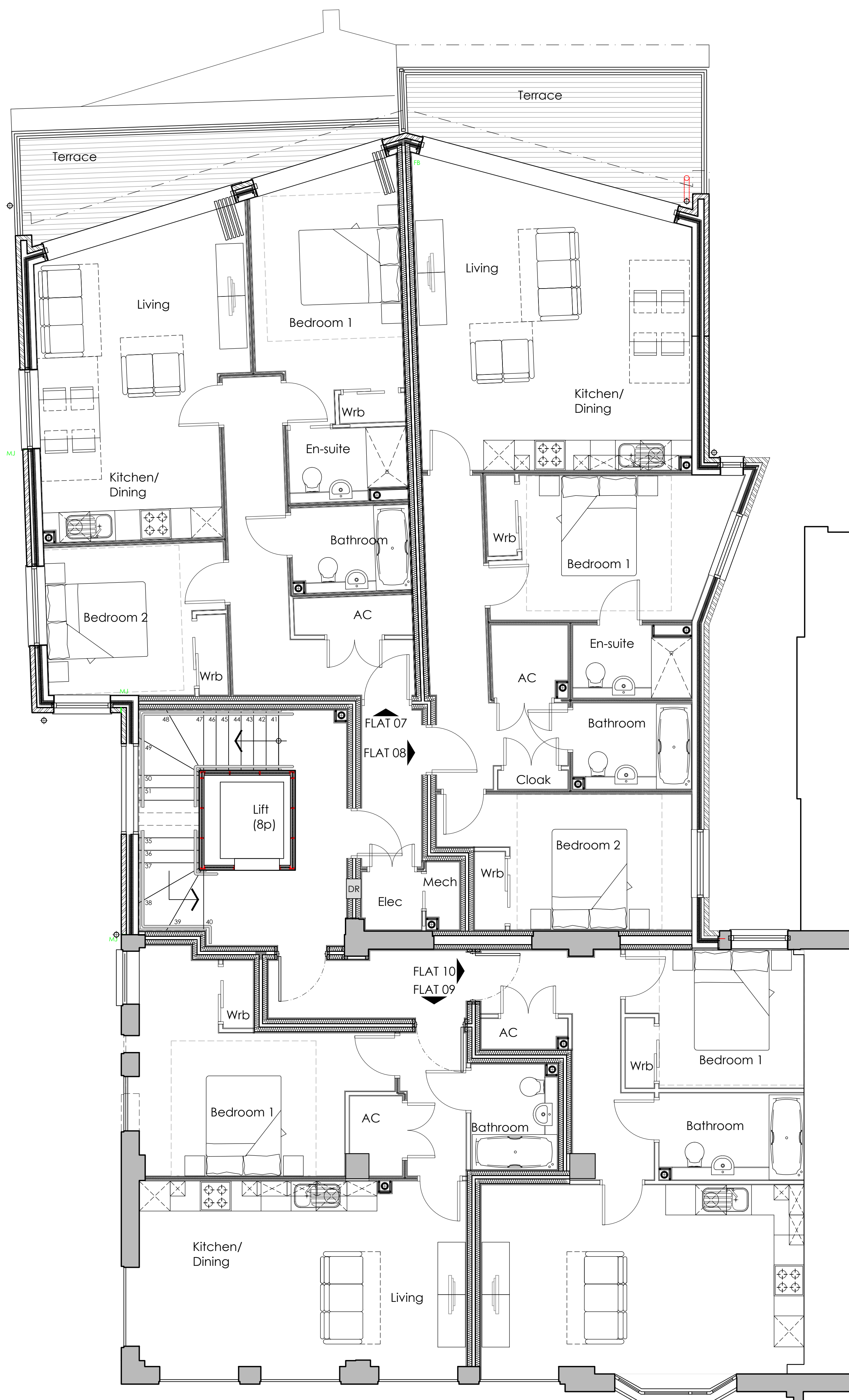
Proposed Second Floor Plan @ 1:50