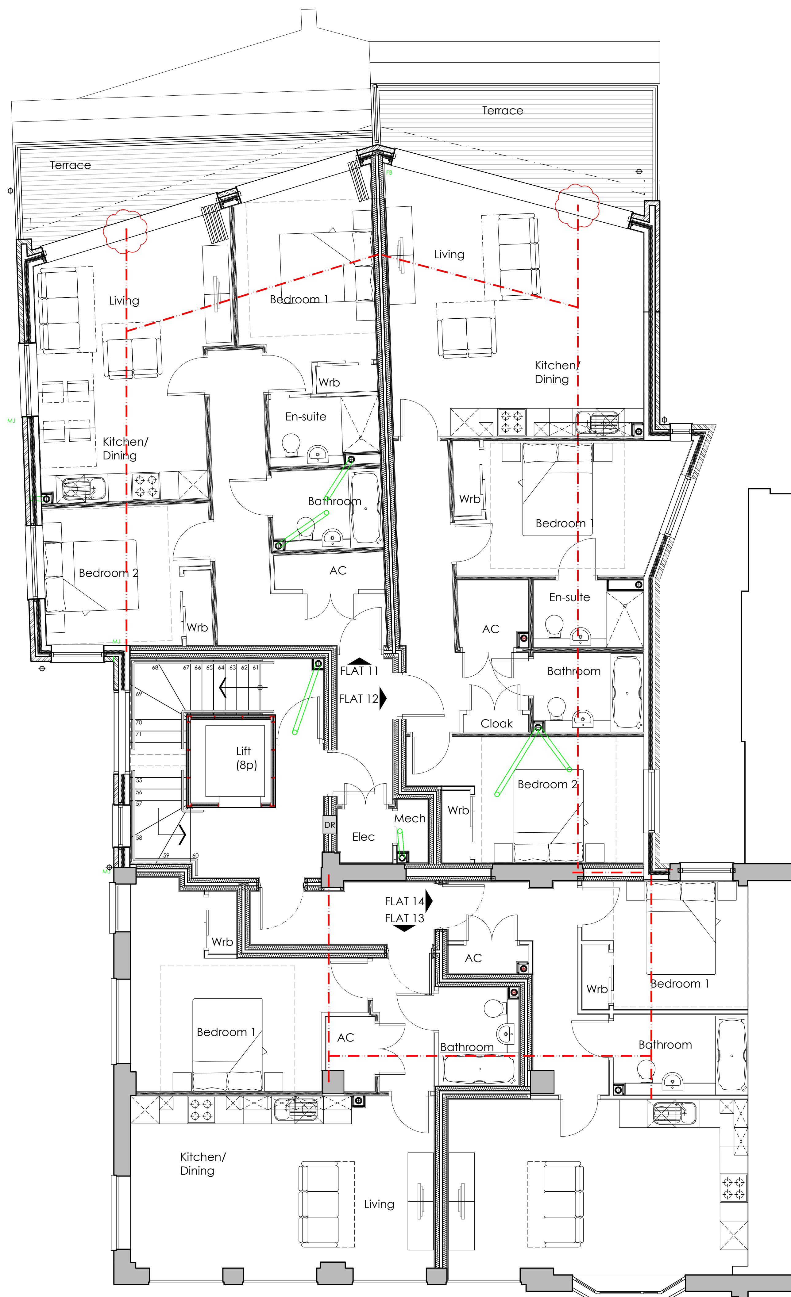
Proposed Third Floor Plan @ 1:50